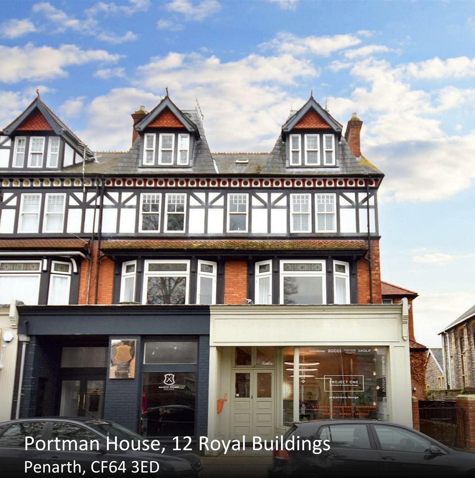
Portman House, 12 Royal Buildings Penarth, CF64 3ED